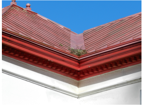
Organic matter on roof