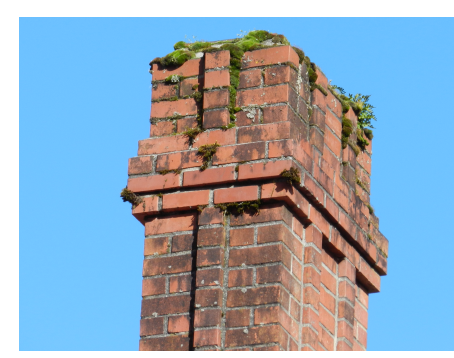
Organic matter on chimney/deteriorated brick