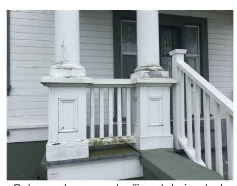
Columns, bases and railing deteriorated