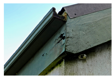
Missing gutter end cap / deteriorated fascia