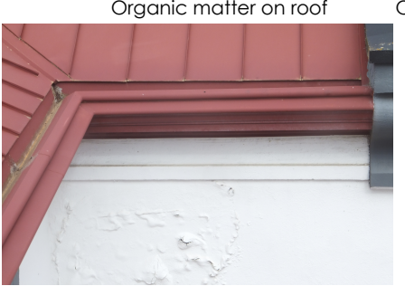
Debris in gutters / blistering coating