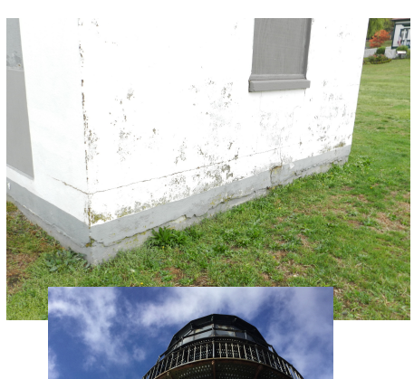
Stucco spalling/ poor drainage away from building