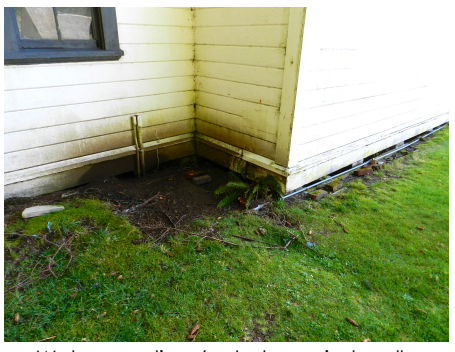
Water ponding / splash against walls