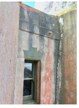
Growth on walls