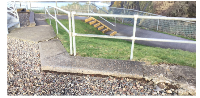
Sidewalk cracks and heaving