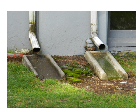
Water puddles near foundation