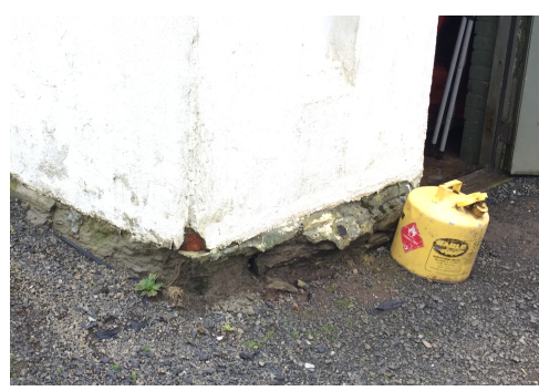
Deteriorated foundation / combustibles in building