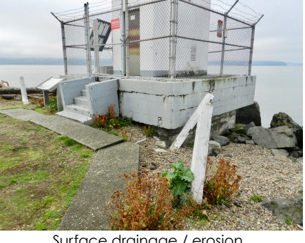
Surface drainage / erosion