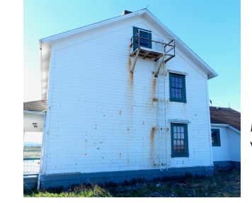
Metal corrosion / wall staining