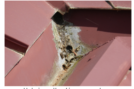
Hole in gutter / improper slope

Common Lighthouse Building Problems Lighthouse Environmental Program